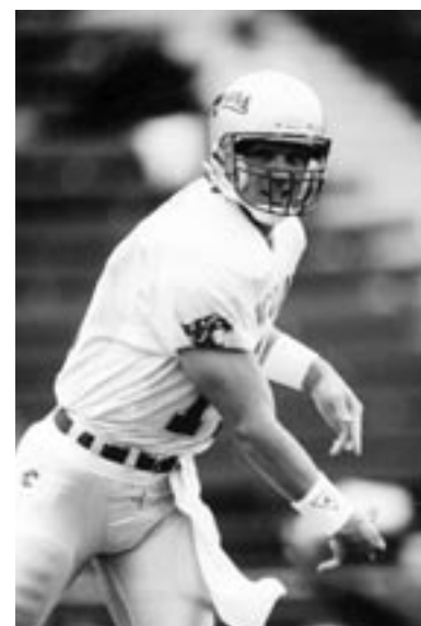
Drew Bledsoe was an All-American in 1992 while leading WSU to a Copper Bowl win.