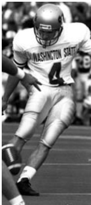
Jason Hanson set an NCAA record with a 62 yard field goal at UNLV.