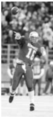
Ryan Leaf holds the record for TDs in a season with 34.