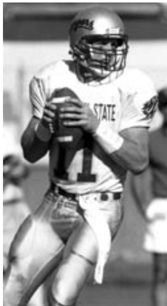
Drew Bledsoe passed and ran 74 times in a 1992 game against Montana