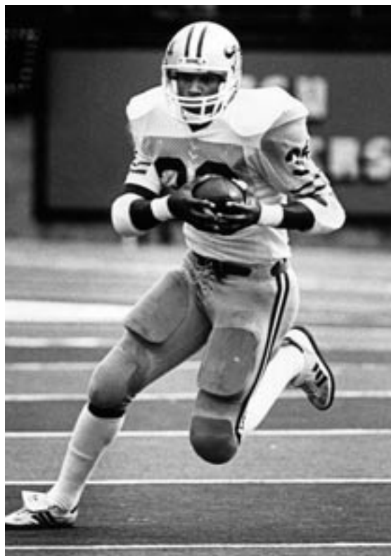
Rueben Mayes held the NCAA single game record after running for 357 yards at Oregon in 1985.